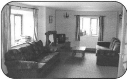
An example of the excellent quality guest accommodation.