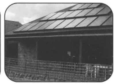
The swimming pool is a major asset to the development and popular with guests and local folk. Right: The innovative solar panels which heat the pool.

The Auction of Promises was a great success with over £2,000 raised. After expenses, cheques for £650 each were presented to Yorkshire Air Ambulance, Ribbles Valley Crossroads & the Community Hall. Thanks to everyone.